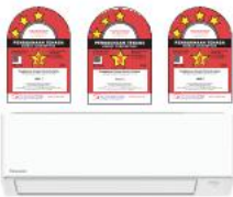
CS-YU9AKH-1 | CS-YU12AKH-1 | CS-YU18AKH-1