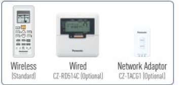
Wireless (Standard) | Wired CZ-R0514C (Optional) | Network Adaptor CZ-TACG1 (Optional)